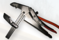
Ground Grip SAFE 8071