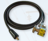
Switchable Ground Magnet SAFE 80730